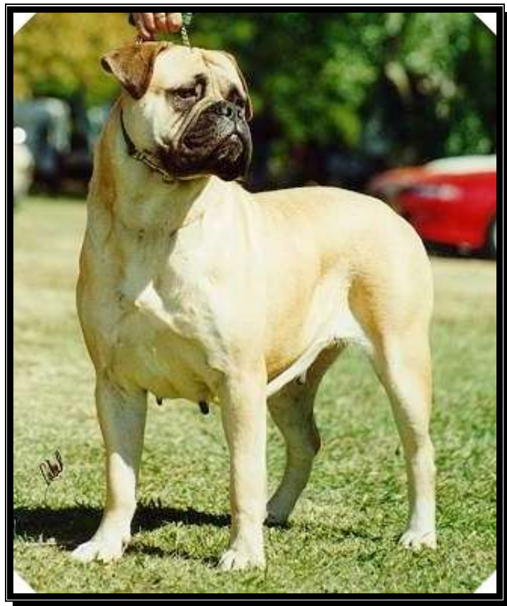
Bullmastiff Bitch fawn in colour