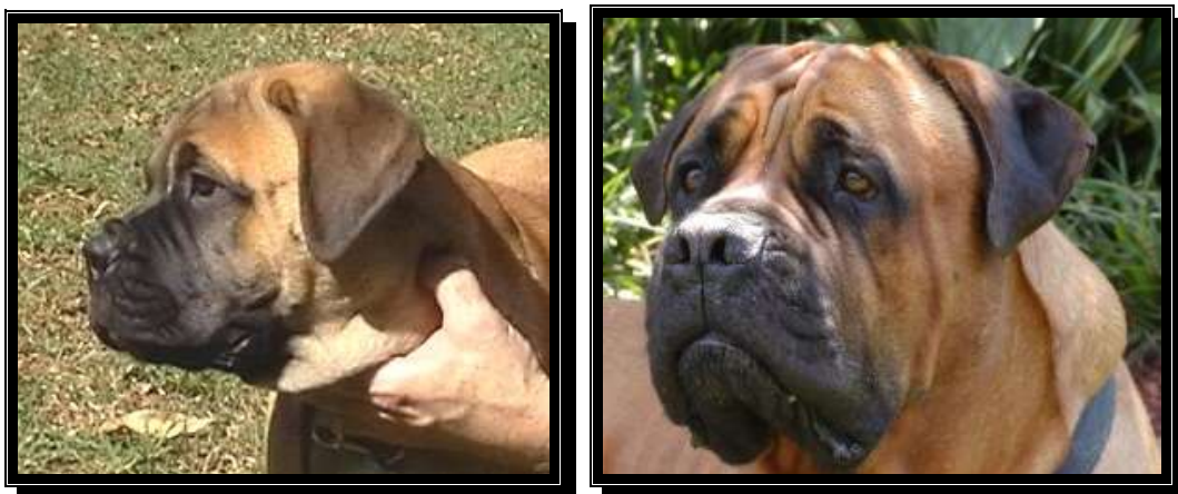
The above photos are of puppies displaying a longer muzzle.

One other point to remember is that pure bred Bullmastiffs might have small to large splashes of white on their chests or a white toe but they do not have white anywhere else on their bodies.